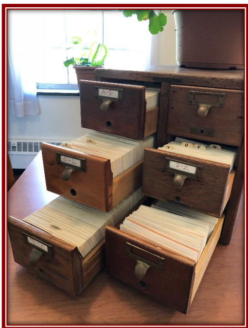
Our original database