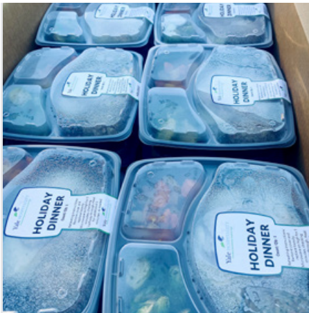
Holiday Meals boxed up and ready for delivery.

They coordinated the preparation and delivery of over one thousand meals to seniors in the city and several nearby towns.