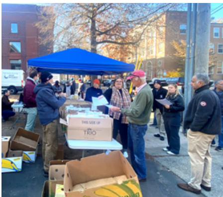
Volunteers at Temple Street about to deliver over 1,000 meals.

The day was marked by a deep commitment to those we serve.