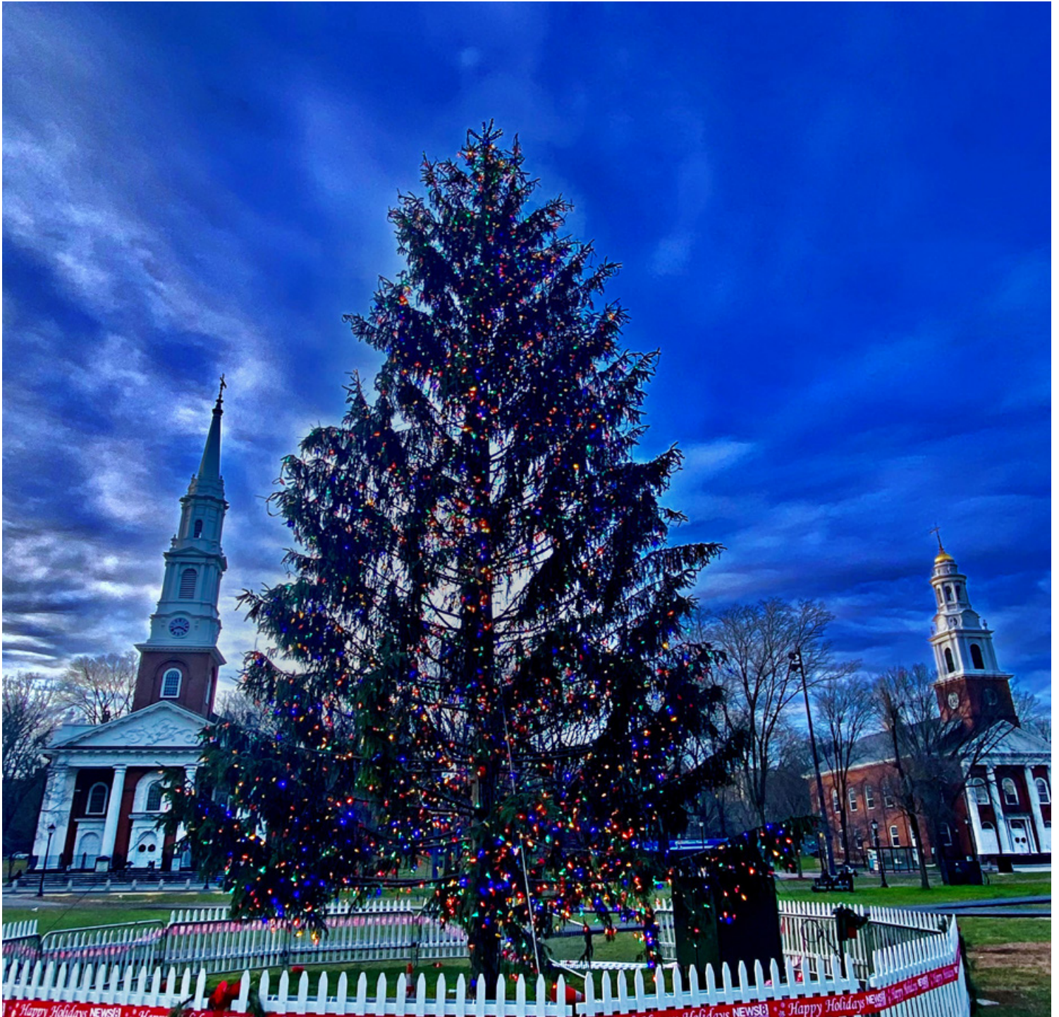
Holiday tree on New Haven Green just after sunset..

INTERFAITH VOLUNTEER CARE GIVERS OF GREATER NEW HAVEN