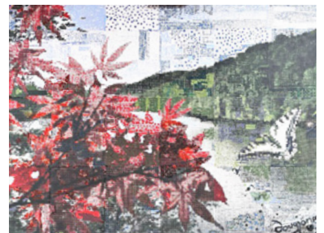
“Our Communities at the Public Garden’s Edge.”

To learn more, visit the new CT Garden Collaborative website: connecticutpublicgardens.org/