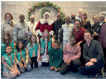
Cultivating Connections (and Santa) at a Christmas concert outing.

IVCG was founded in 1984— initially as Downtown Cooperative Ministries— after the Robert Wood Johnson Foundation selected New Haven for one of its first “Faith In Action” programs.