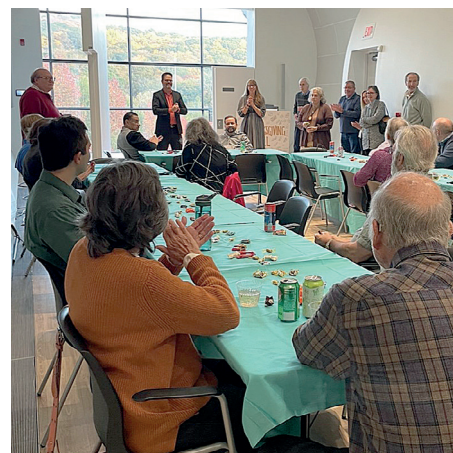
We thanked all our volunteers in October.